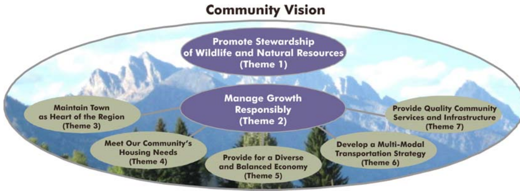
Figure 2.2: The 2009 Community Vision is set against the backdrop of Greater Yellowstone Ecosystem and the eight community themes are related to each other, balanced, and prioritized through the lens of sustainability.

The policies of Theme 1 – Practice Stewardship of Wildlife, Natural Resources, and Scenic Vistas are the priority of the community because they speak directly to ecosystem and natural resource preservation and protection – the paramount consideration of sustainability. However, sustainability also respects existing private property rights, State allowed development, 13 and existing neighborhoods. The policies of Theme 2 – Manage Growth Responsibly ensure that the provision of the community’s needs and desires are met in sustainable manner. Themes 3-8 each discusses in detail a specific community need and/or desire. 14 The community recognizes that there will be trade-offs between these themes as efforts are made to achieve the goals of each. However, sustainability dictates that, there is no situation in which achievement of a goal, principle, or policy in Theme 3-8 will take priority over the wildlife, natural resource, and scenic vista stewardship policies of Theme 1 or the growth management policies of Theme 2. This is because through the lens of sustainability, this Plan makes clear the singular importance of ecosystem and natural resource preservation and protection in the long-term achievement of all of the community’s goals.